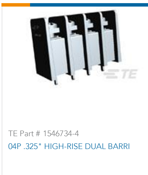
TE Part # 1546734-4 04P .325\"/>